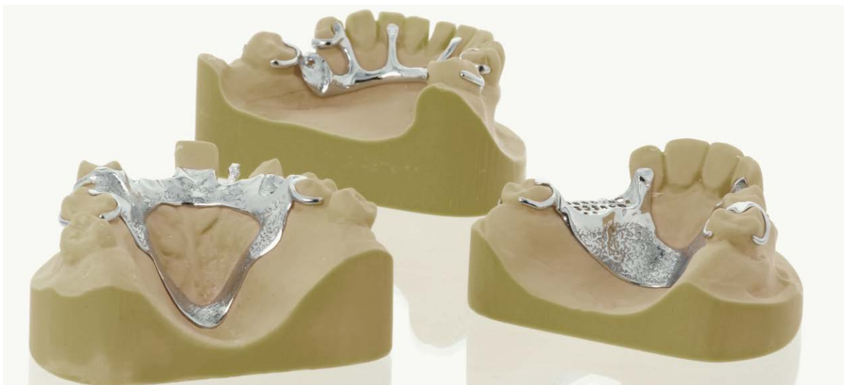
A cluster of various removable partial dentures designed by Gill Egan

Using Renishaw's additive manufacturing system, the denture is built using laser powder bed fusion (LPBF). A high-powered ytterbium fibre laser beam is focussed onto the powder bed, selectively melting 40-micron layers of cobalt chrome powder until the complete component has been built.