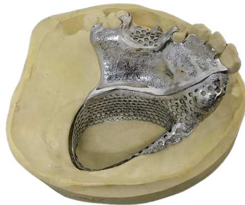
Removable partial denture incorporating a palatal obturator, design by Gill Egan