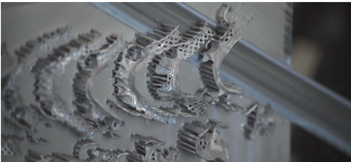
Removable partial dentures being removed from a build plate