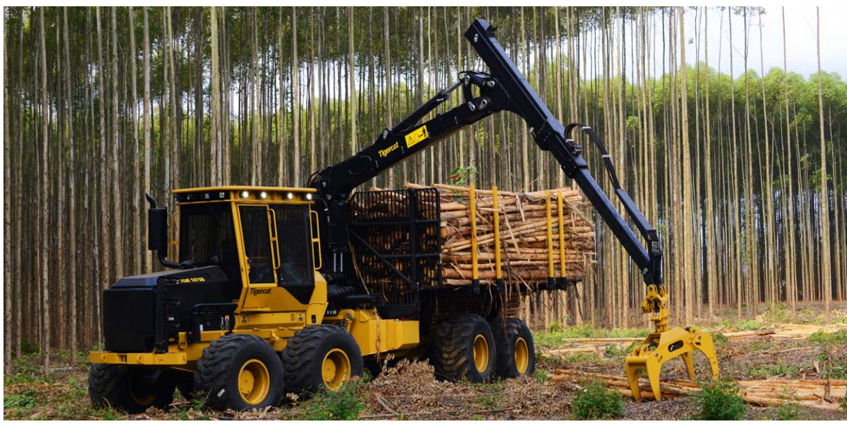
1075 Forwarder

Designed to aid workpiece set-up and inspection on multitasking machines and machining centres, the flexible RMP60M spindle-mounted radio transmission probe was deployed by Tigercat throughout its Cambridge production line. Drawing on Renishaw's wide range of compatible ceramic stem and ruby ball styli, the company was able to develop automated set-up solutions, customised to meet the specific demands of Tigercat's many large and varied workpieces.