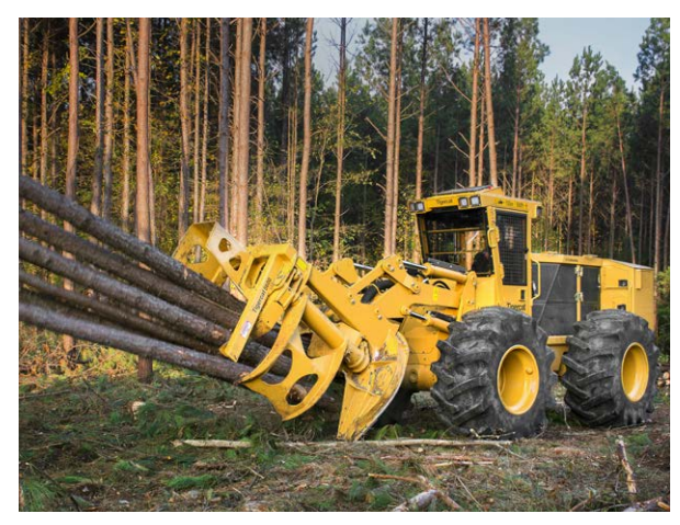
724G Feller Buncher

The integration of Renishaw's high-accuracy radio transmission probes into Tigercat's production processes has seen workpiece set-up times reduce by 75%. Manual set-ups that once took an hour have been replaced by automated set-ups that take 10-15 minutes.