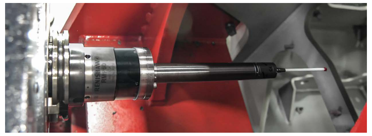
Renishaw RMP60M machine tool probe