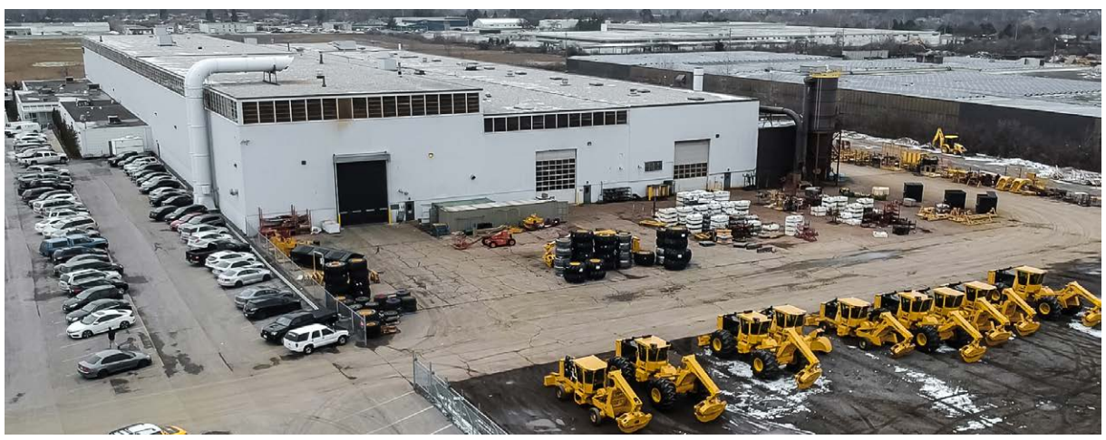
Tigercat Industries Inc. - Cambridge, Ontario, Canada.

It has led to improvements across the board, in terms of machine cycle times, part quality and operator safety. It is also being used for machine health checks, giving Tigercat even greater confidence that all of its production processes are perfectly up to specification.