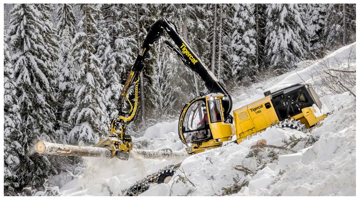
1185 Harvester

For more information and to watch the video visit, www.renishaw.com/tigercat