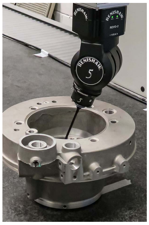
REVO 5-axis head providing infinite positioning capability

Closely partnered with Renishaw since its inception, Apex offered customers the services of an installed base of in-house CMM equipment that included 3-axis CMM systems using traditional touch-trigger and scanning probes mounted on PH10 motorised indexing heads.