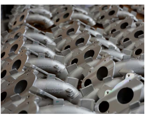
Example of parts manufactured by R. Busi